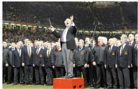
Cantorion Gogledd Cymru

The event is so close to Ottawa, we hope for a good turnout from our members.