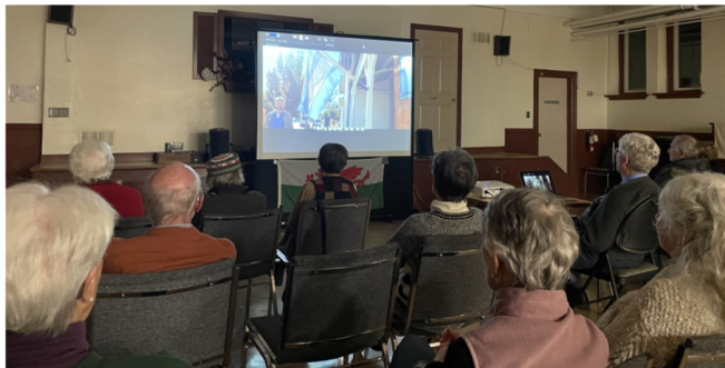
Attendees at Film Night 2026