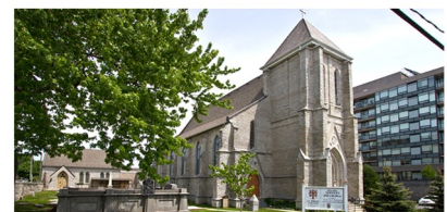
St. Paul's Anglican Church Kingston