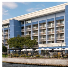
Holiday Inn Kingston Waterfront