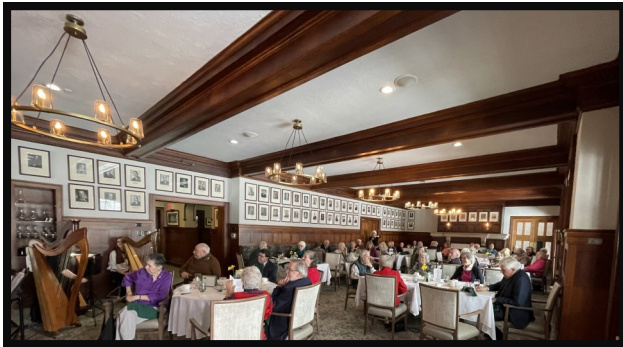
Cinio Dydd Gŵyl Dewi Sant/ St. David's Day Luncheon

The Executive anticipates that many of the usual events will take place in the coming months. This may include a Pub/Quiz Night, a Film Night, some sort of fall event, and the Service of Lessons and Carols. There has been some discussion about providing a mix of online and in-person events so that everyone may participate.