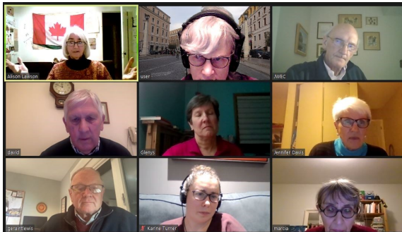
Awr Sgwrsio in January