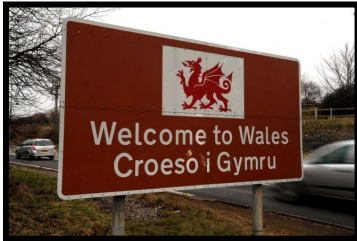
Dyma'r un cyntaf - This is your first sign