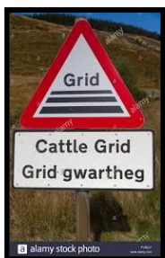
Buwch – Cow Gwartheg - cattle

Ymlaen – ahead Mae'r ffordd ar gau - The road is closed.