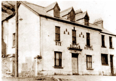
Six Bells Hotel