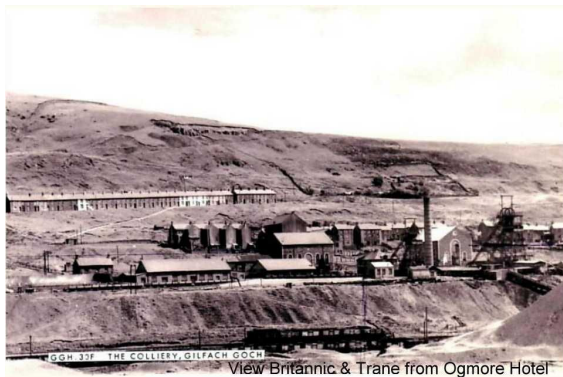
Last 2 collieries in Gilfach Goch