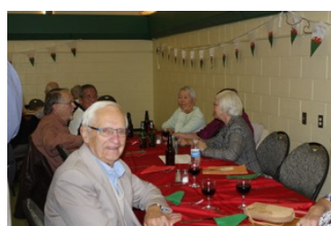
Noson lawen 2015