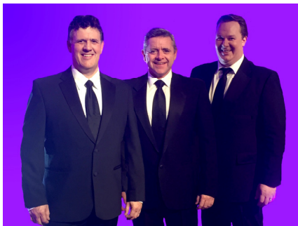
The Three Welsh Tenors